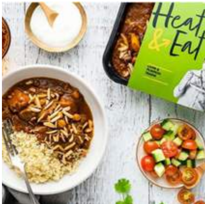
Ready to Eat Meals